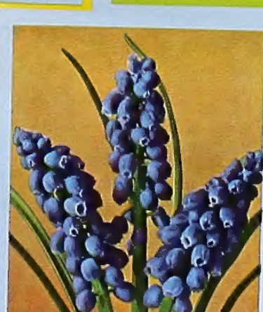
GRAPE HYACINTHS (Muscari)

NO. 5222 25 BULBS ONLY $1.00 50 BULBS ONLY $1.89